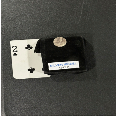
Coin - 1942 P War Nickel - Wayne.