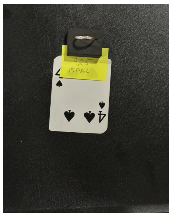
Silver -.925 Opal Ring - Gerry.