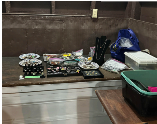
Show & Tell -Pat.