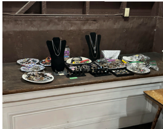
Show & Tell -Pat.