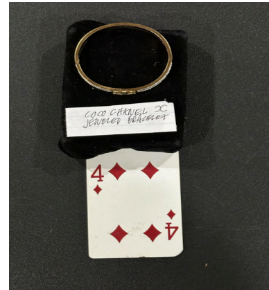
Jewelry -Coco Chanel Bracelet-Wayne.