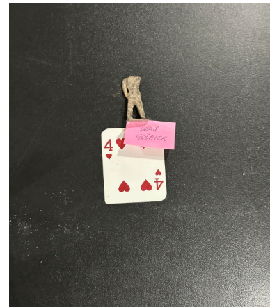
Artifact -Lead Toy Soldier-Eddie.