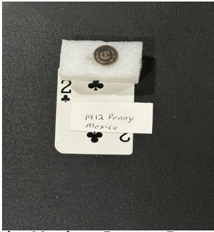
Coin -Mexican Penny - Pat.