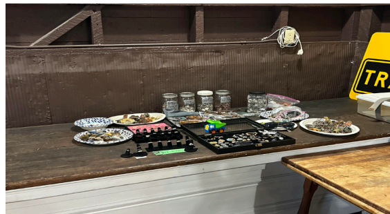
Show & Tell -Pat.