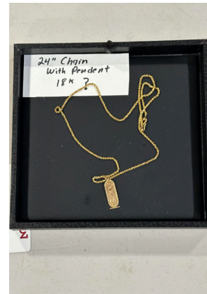
Jewelry -Chain and Pendant - Pat.