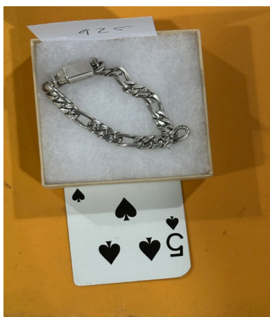
Silver -Silver Bracelet- Marc.