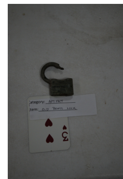
Artifact - Padlock - Sean