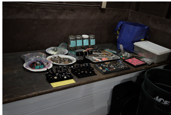
Show & Tell -Pat