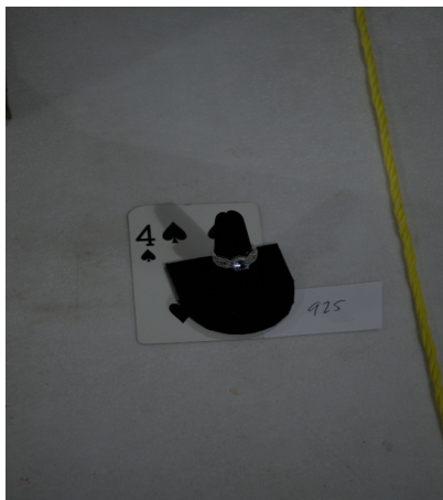
Silver - Silver Ring -Marc