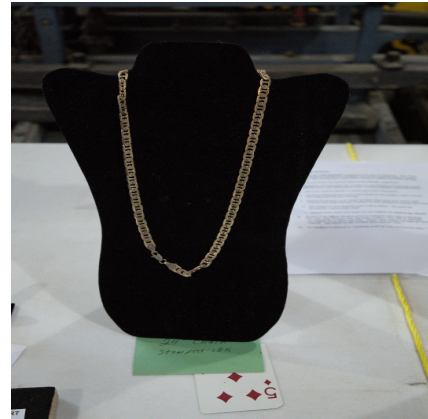
Jewelry - 18K Gold chain-Pat