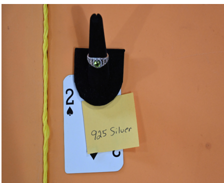
Silver - Silver Ring - Pat Taylor