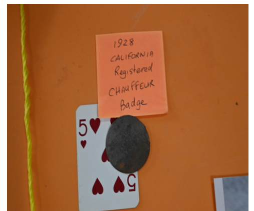
Artifact - 1928 Badge - Eddie Vlassis