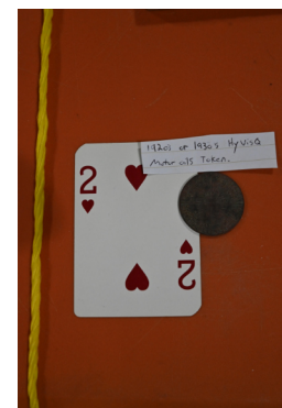
Artifact - Motor Oil Token - Justin Fletcher