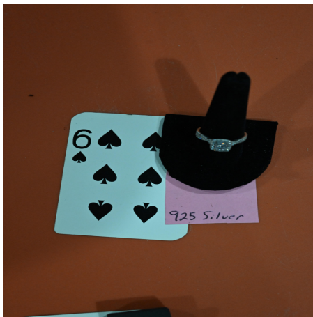
Silver - Silver Ring -Pat Taylor