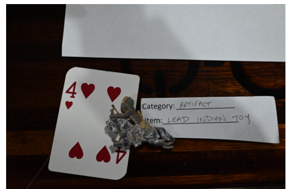
Artifact - Indian Toy - Sean Baas