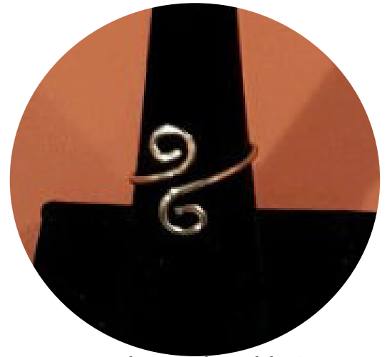
Jewelry - 10 k Gold Ring