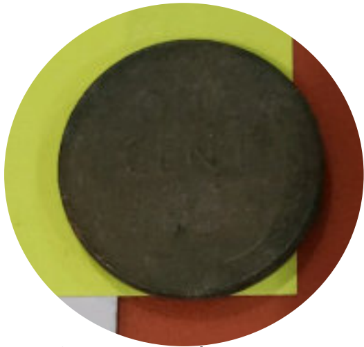
Coin - 1946 D Wheat Penny