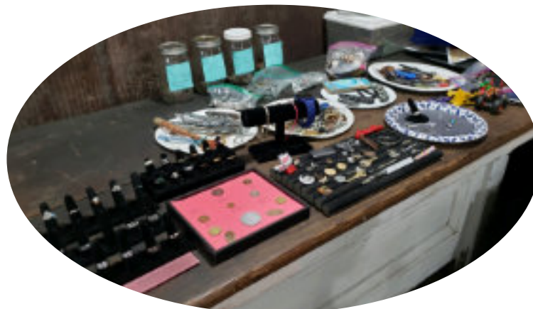
Show & Tell - Pat Taylor