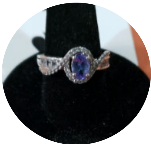
Silver - Silver Amethyst Ring