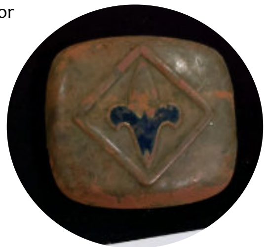
Artifact - Vintage Brass Cub Scout Neckerchief Slide