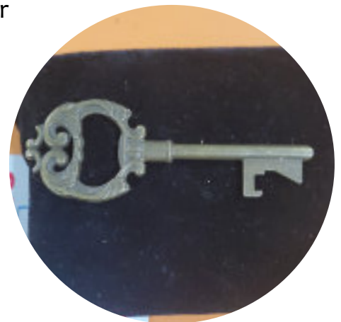
Artifact - Metal Key