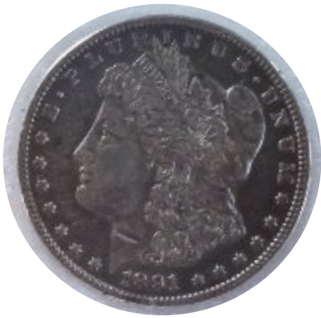
Coin - 1891 CC Morgan Silver Dollar