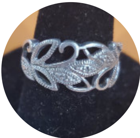
Silver - Silver Ring